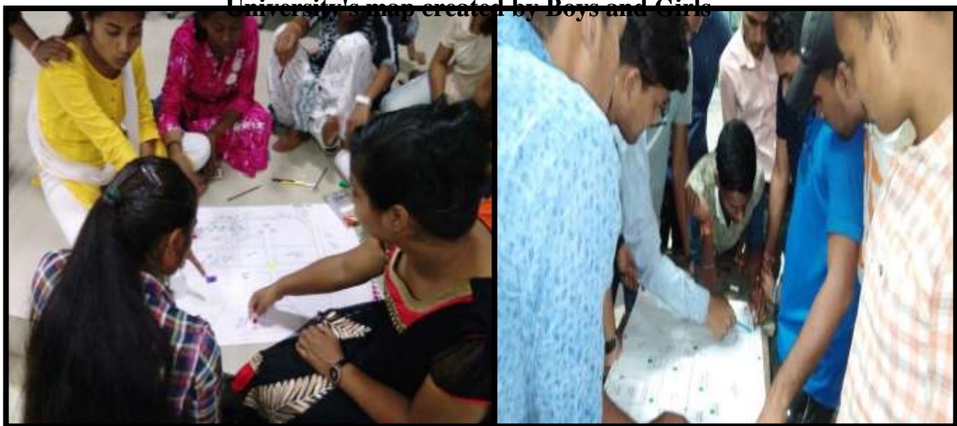
University's map created by Boys and Girls