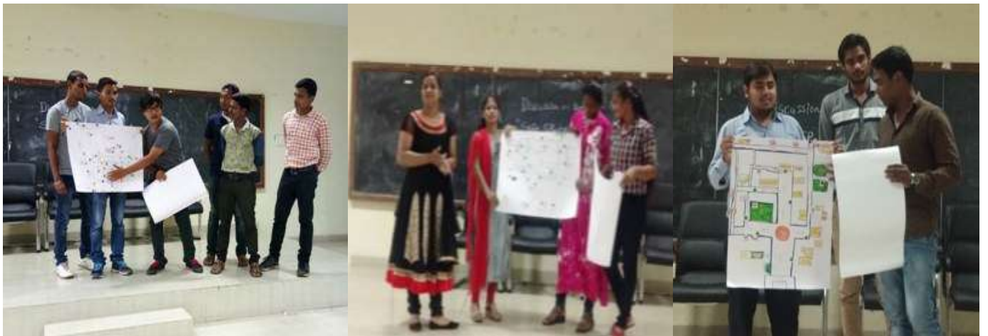
Sharing University map