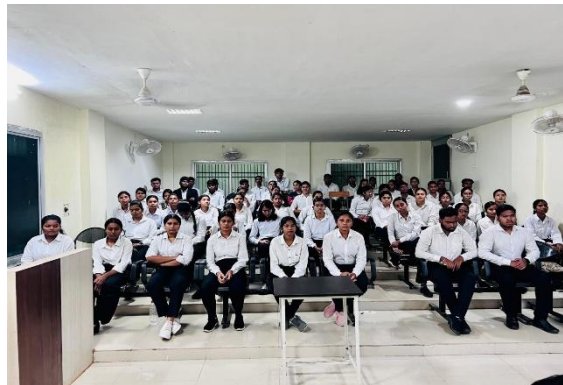
Students attending the competition as audience in Moot Court Hall, Law Department