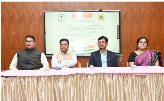
Hon'ble Guest along with Hon'ble VC Sir on stage