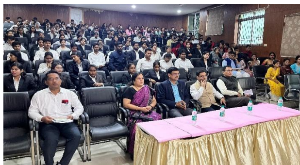
Students and Faculty in attendance