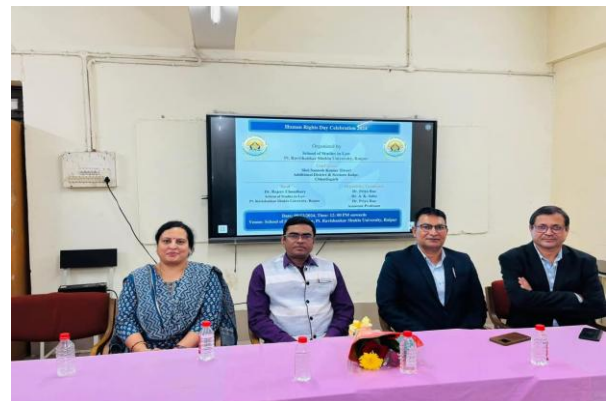
Hon'ble Guest with the Head & Faculty of Law Department