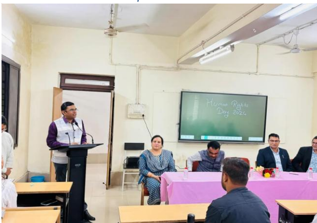
Hon'ble Guest addressing the Students and Faculty