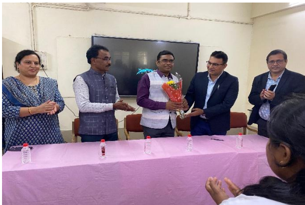
Hon'ble Guest being Welcomed by the Head & Faculty of Law Department