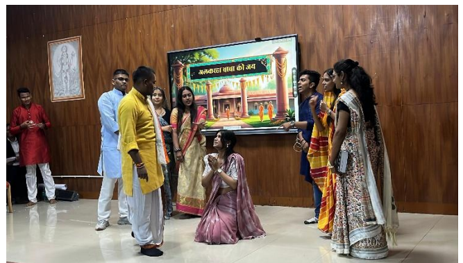
Students performing Drama on Social Issues