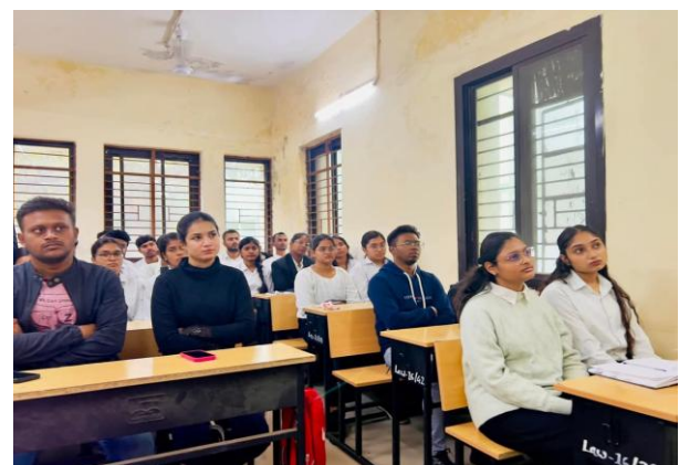
Students in Attendance