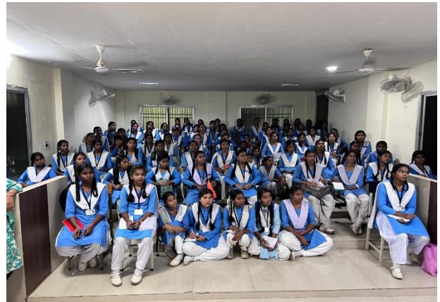
Visiting Students of Govt. Girls School in Moot Court Hall, Law Department