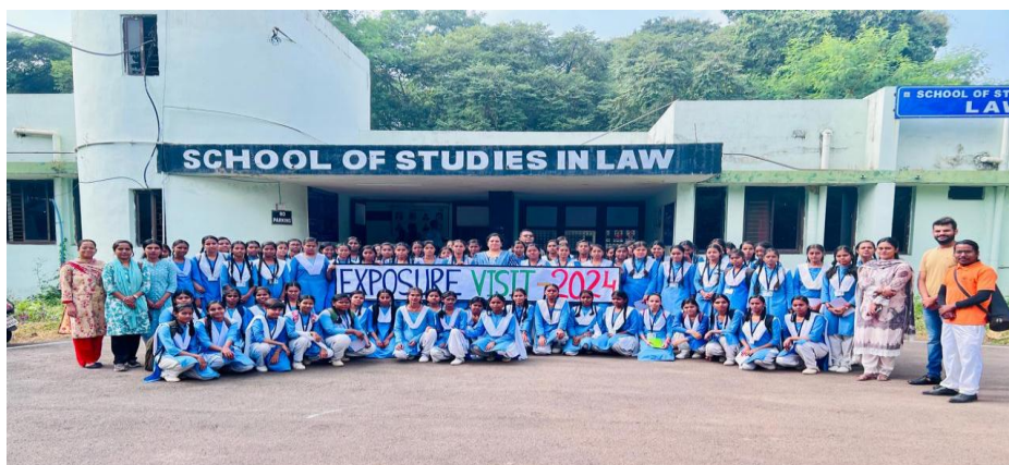
Visiting Students & Faculty of Govt. Girls School along with Faculty of Law Department