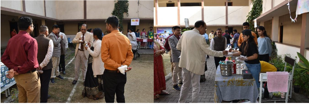
Guests enjoying Anand Mela