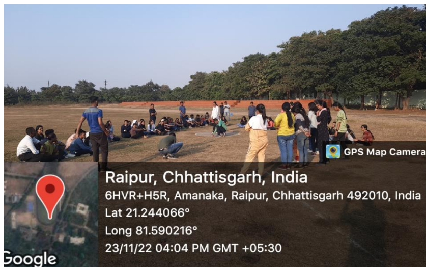
Students throwing shotput ball