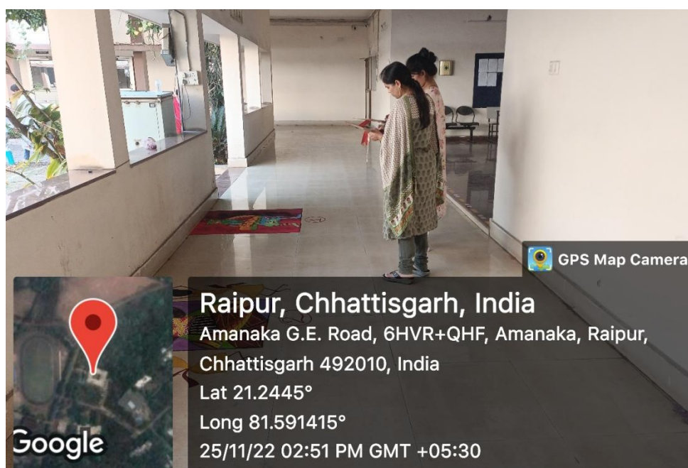
Judges evaluating the rangolis made by students