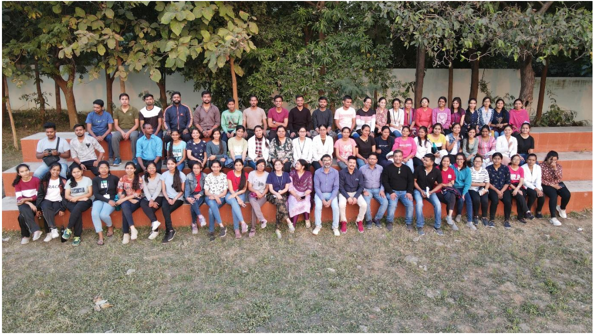
THE BIOTECH FAMILY 2022