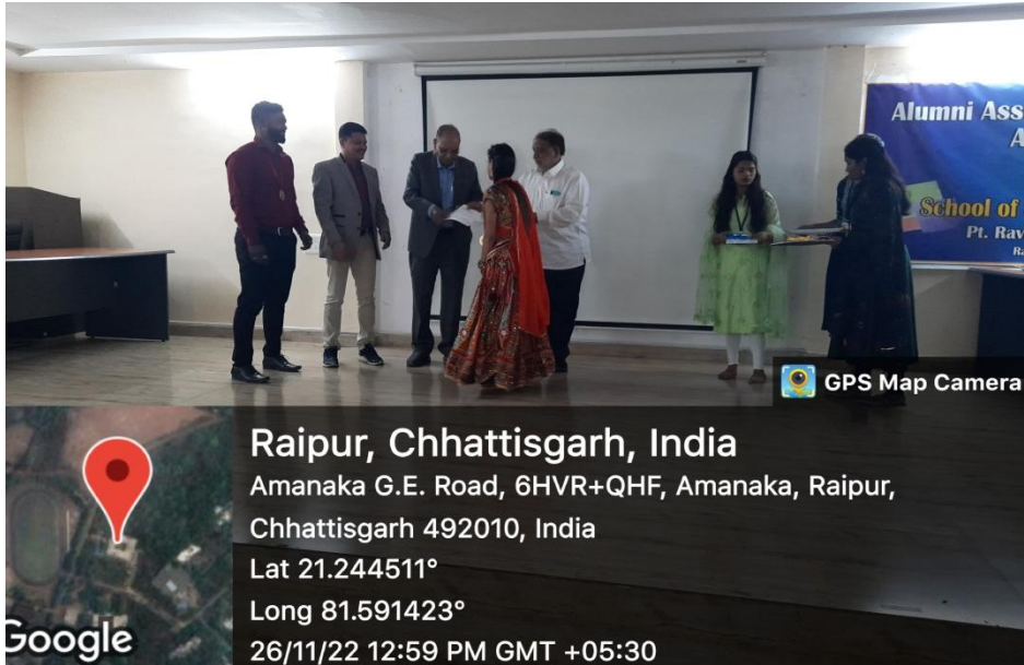
Achievers receiving their certificates and medals