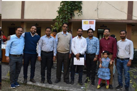
Interaction with previous alumni