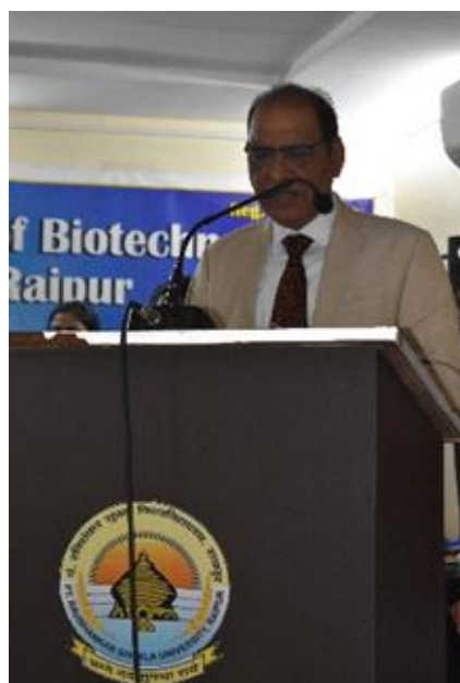
Speakers of the ceremony