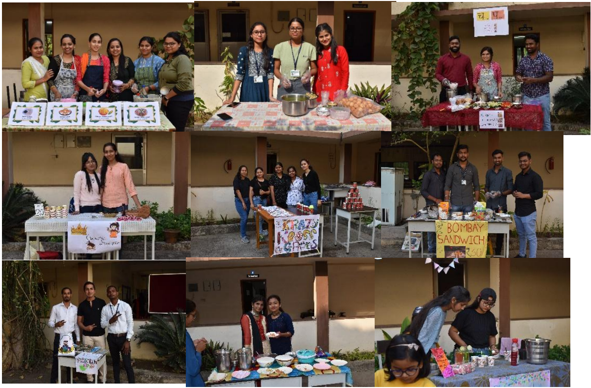
Various food stalls with their chefs