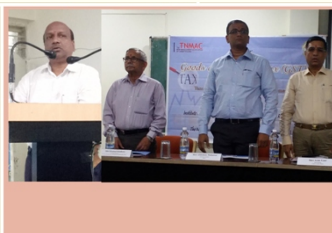
Seminar on "Goods and Services Tax (GST)"