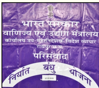
Work Shop on Export