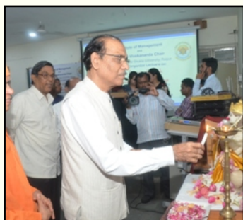
One Day Workshop on Secrets of Work