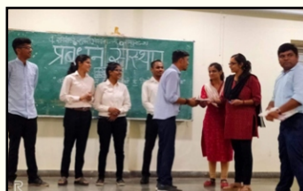
Discussion on Gandhiji Ke Vicharon Ki Prasangikta