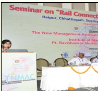
National Seminar on Rail Connectivity