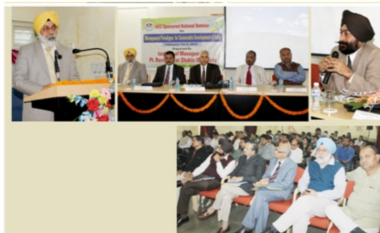
UGC Sponsored national Seminar on "Management Paradigm on Sustainable Development of India"