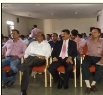
Tow days seminar on Prospects of Insurance Industry in the Era of Financial Inclusion