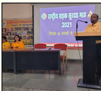
Sadak Surksha Saptah