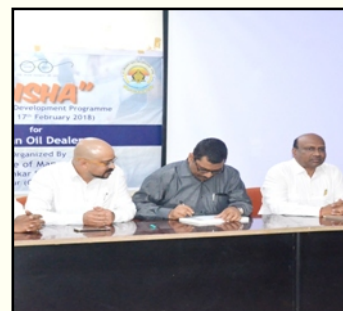
Two days Management Development Workshop For Indian Oil Dealers