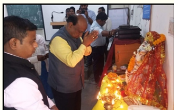
Basant Panchami Celebrations