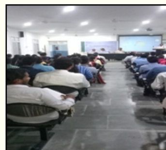
Seminar on Goods and Service Tax