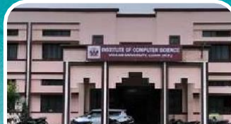
Vikram University (Ujjain)