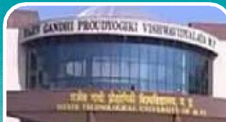
Rajiv Gandhi Pradyogiki