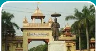
Banaras Hindu University