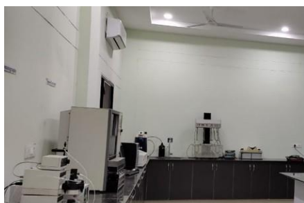
CENTRAL INSTRUMENTATION LABORATORY