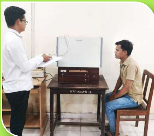
Depth Perception Test