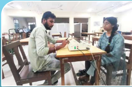
Audio Visual Reaction Time Test