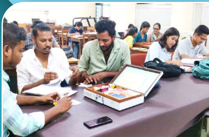
Students Examining Bhatia Battery

To create community of intellectual excellence and foster on evolving understanding of psychological science.