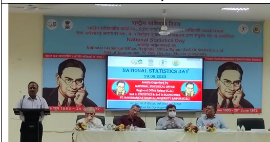
17 th National Statistics Day, 2023