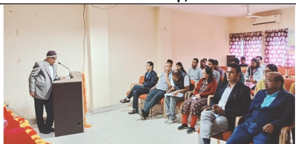
Public Outreach Lecture, 2023