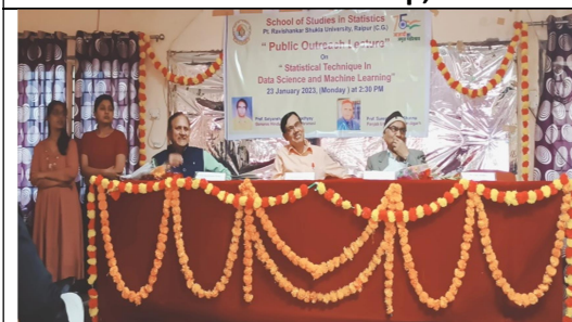
Public Outreach Lecture, 2023