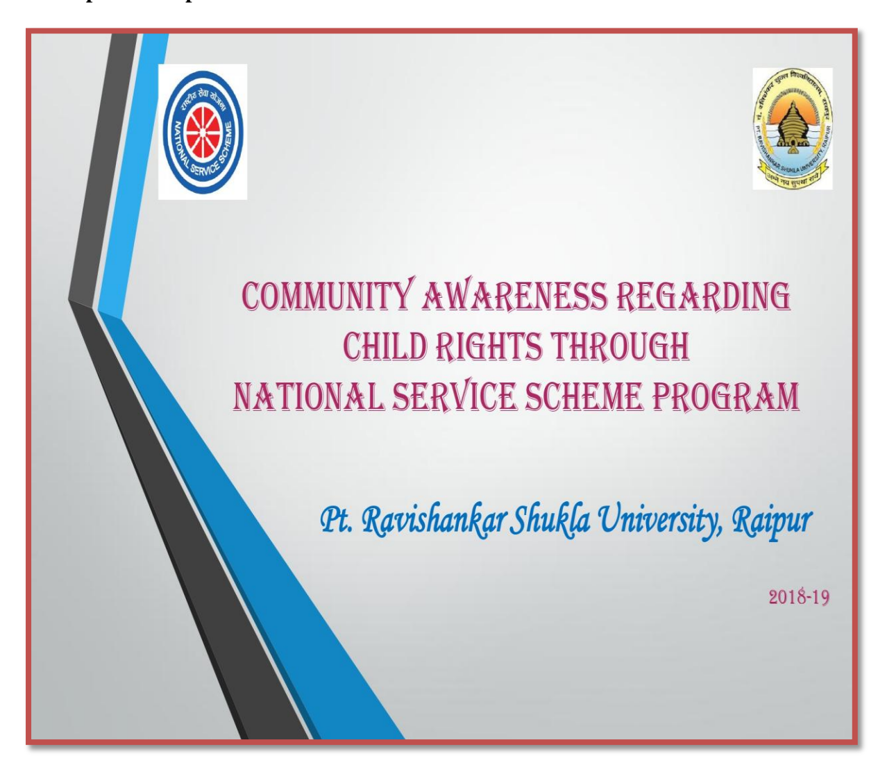
Practice 2: Community Awareness Regarding Child Rights through NSS Program in partnership with UNICEF: