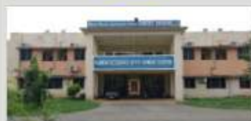
HRDC Building and Guest House (side view)