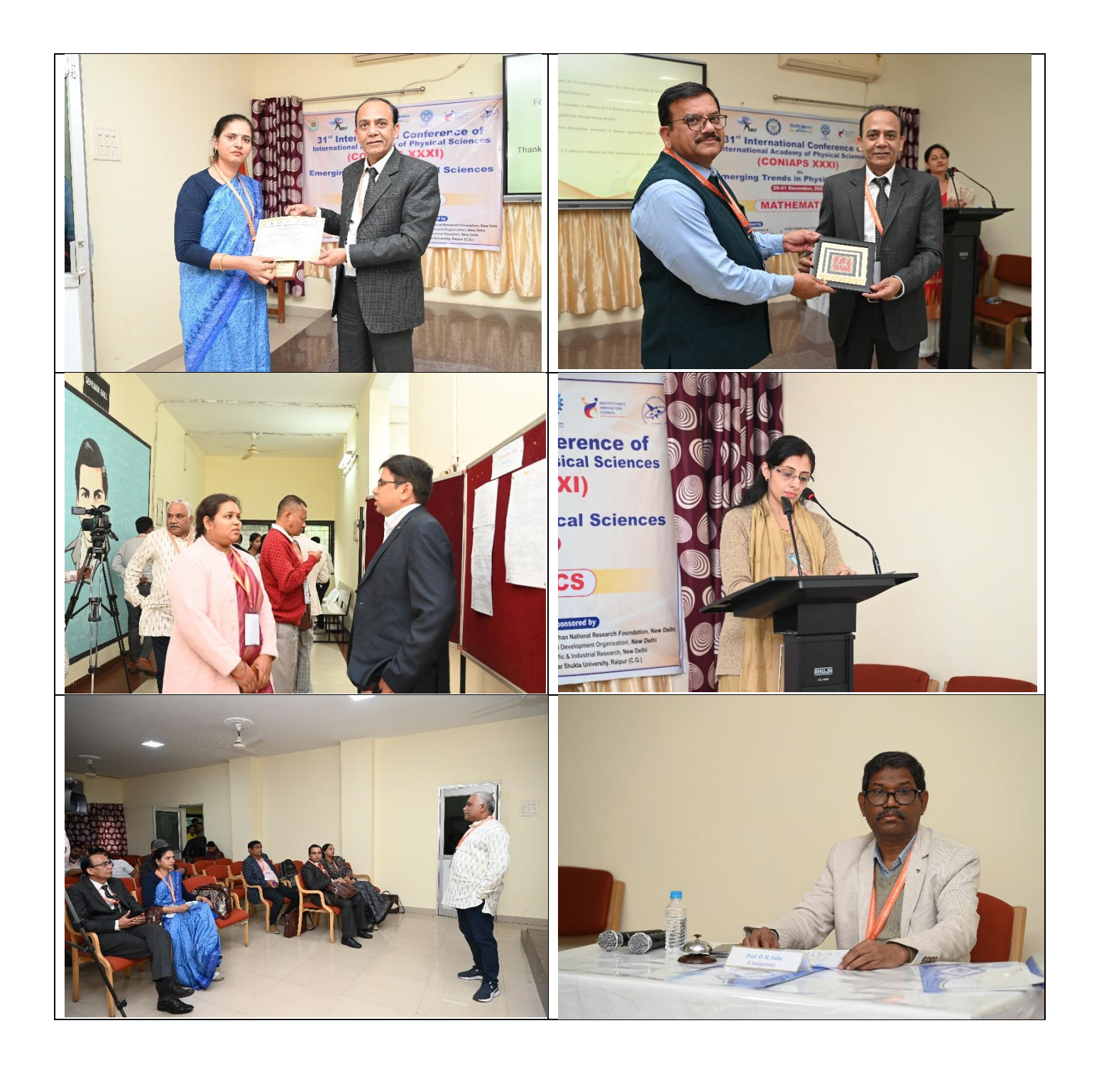
Invited Lectures and YSA & Oral Presentations (Chemistry)